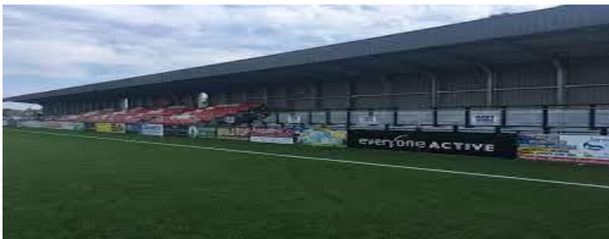
Ashburn Road Main Stand and two new enclosures

Take the A1 to Junction 49 then take a left to A168 then at the first roundabout go straight on and at the second take the second exit and continue on to Thirsk and at the roundabout take the first exit and at the crossroads roundabout take the third exit onto Sutton Road and take it to Helmsley and at the Bond roundabout take the third roundabout and then at the next roundabout at East Ayton onto Racecourse Road and continue on into Scarborough and just past the Crown Arms roundabout take a right at the Newton Arms lights and second left into St James Road and at the roundabout take the first exit at the mini roundabout then after the railway bridge take a first left and the ground is on the left.