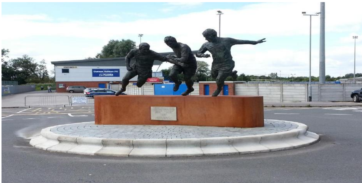
Geoff Hurst (1941 – Pd) (England), Jimmy Armfield (1935 – 2018) (England) and Simone Perrotta (1977 – PD) (Italy)

Train to Ashton under Lyne Railway Station then walk out of the main entrance walk to the top of Turner Street then take a left into Bootle Street and walk to the end turn right then cross the road and turn left take the first left into Taunton Road walk to the end then turn left and walk down Knowles Road and at the end with the mini roundabout turn right into Richmond Road and then take a left at the Sports Centre and the ground is on the right.