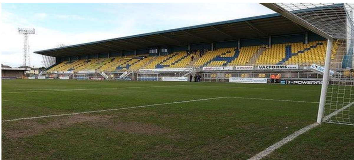
Main Stand (Bristow Bench)

The new stand which was opened in July 2012 has a capacity of 1,750 and called Bristow's Bench after a former Director of the Club, the stand also includes new dressing rooms, disabled facilities and a new press box. It is a fairly simple looking affair, although it has windshields to either side situated below an elevated roof. The stand is raised above pitch level meaning that spectators have to climb a small staircase to enter it.