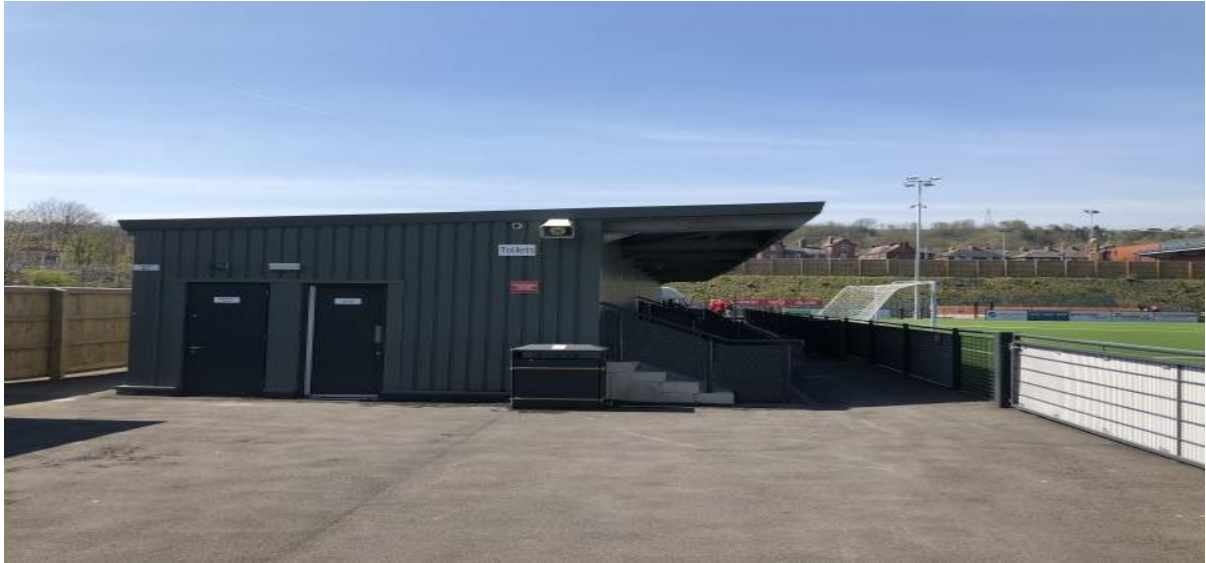
Railway Lane Enclosure