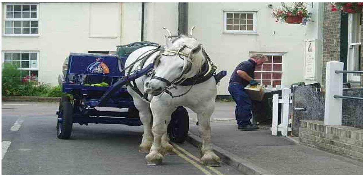
Brewery delivery at Litchfield Vaults ("mines a Pint of Bitter" says Old Wallace the horse)

Litchfield Vaults which is in Church Street which is between the cathedral and the main shopping square and they serve a fine selection of well-kept ales from Adams Brewery from Southwold although the landlord does rotate the selection available, plus a good selection of hot snacks. From there it's about a 10 minute walk to the ground'. This pub is also listed in the CAMRA Good Beer Guide (See Walking guide).