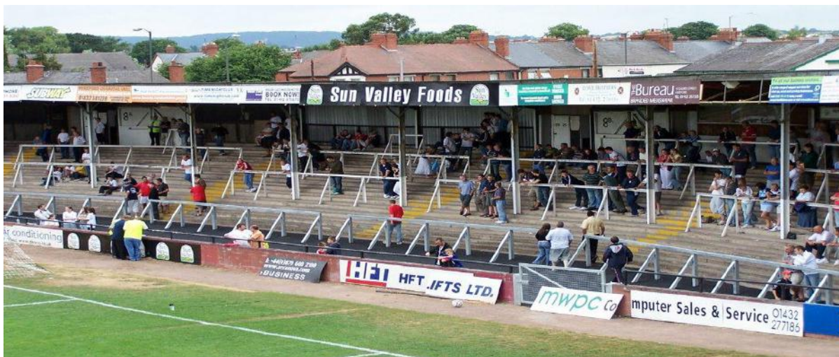
The Meadow End