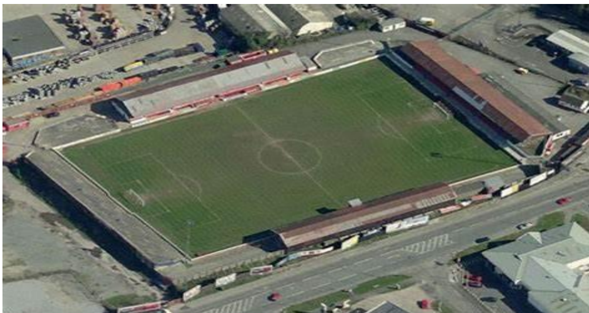
Tigers roar aerial