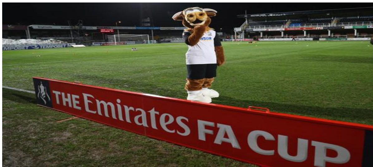
Bully the Bull