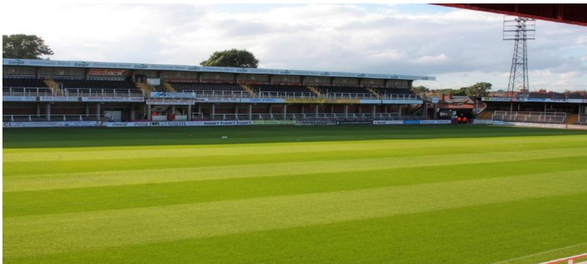
Edgar Street Stand