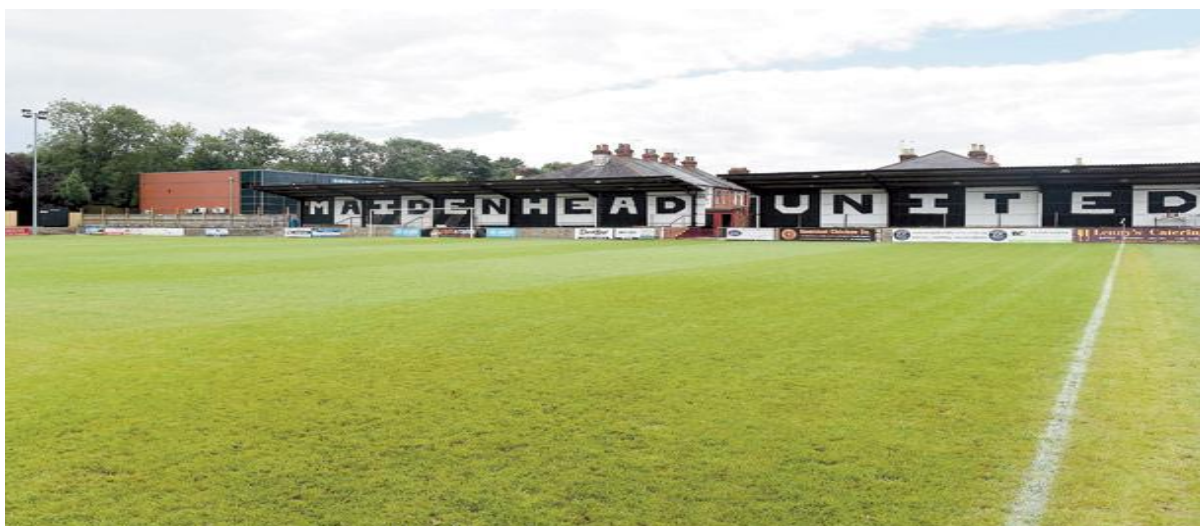
Bell Street End

Take the M6 to just after Junction 5 and merge on to the M42 At junction 3A, exit onto M40 toward London/ Warwick/ Stratford, then at junction 4, take the A404 exit to High Wycombe/ Marlow/ Maidenhead, at the roundabout, take the second exit onto A404 At the roundabout, take the second exit onto Marlow Rd/A308 and continue to follow A308 down Gringer Hill and on into Marlow Road and at the roundabout go straight on at the lights just before the Odeon cinema.