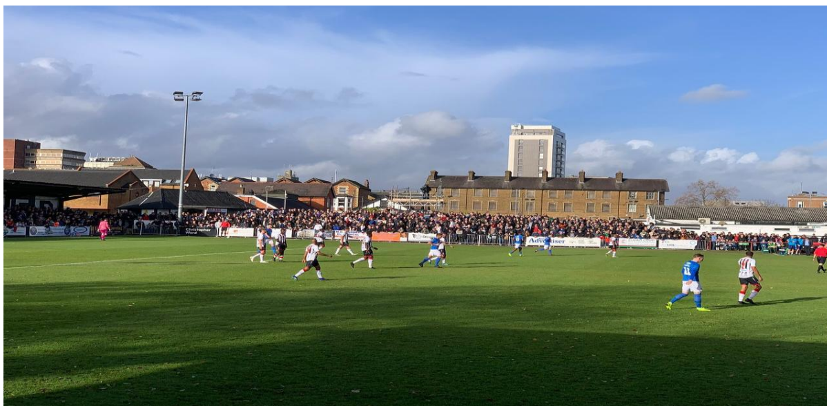
Bowling End/ York Road

Train to Maidenhead Railway Station when you come out of the station turn left and walk up King Street past the clock tower till you get to the Bell pub there cross the road and turn right into Queens Road when you get to the Honeypot Arms pub turn right and walk down York Road the ground is on the right, down the lane just before the Bowling Green. Those coming from the station should take the first right into Bell Street and use the turnstile in Bell Street for segregated games.