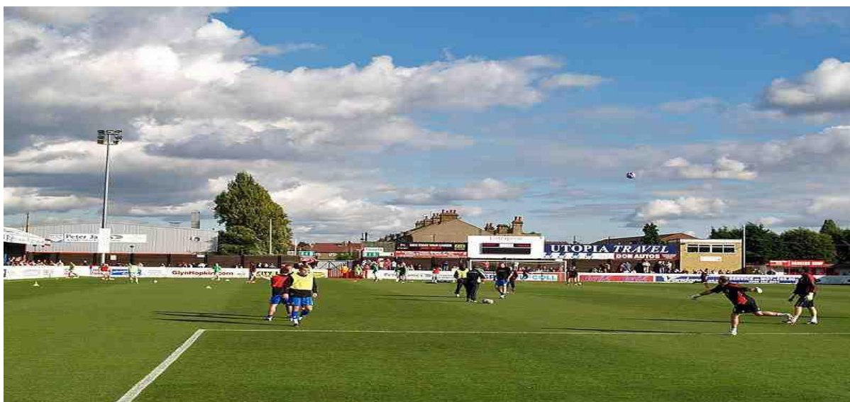
Bury Road End

The North Terrace, which runs along one side of the pitch, is known affectionately by the Dagenham fans as 'The Sieve' as apparently at one time it was famed for its leaking roof. This old-fashioned looking terrace is partly covered to the rear and has a number of supporting pillars. It also has a television gantry perched upon its roof. Unusually the teams emerge from not from the main stand, but from a tunnel located in the new Marcus James Stand at one end of the ground.