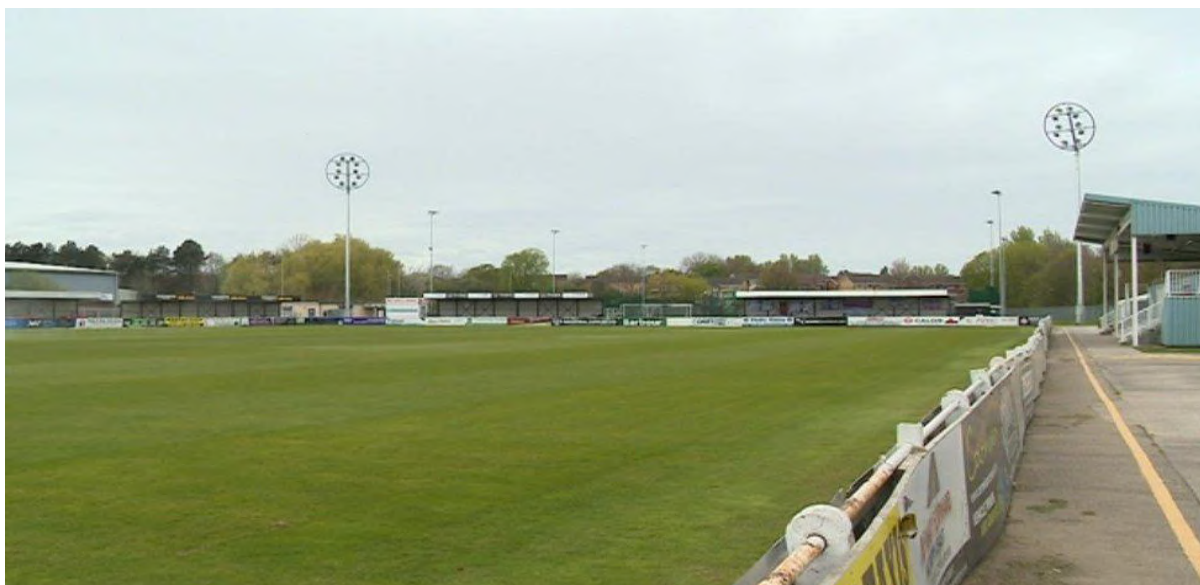
Shaftsbury and Beechgrove ends

From the North: take the A1 then take the sign for the A19 and Blyth and take the second exit at the roundabout and at Cramington roundabout take the third exit and at the Mc Donals roundabout take the second exit and after just over two mile take the exit for South Shields/Jarrow and take the second exit at the roundabout then take the first right and then first left, first right pass the metro station on Kingsway turn left and go under two bridges till the end then turn right into Shaftsbury Avenue and the ground is 200 yards on right.