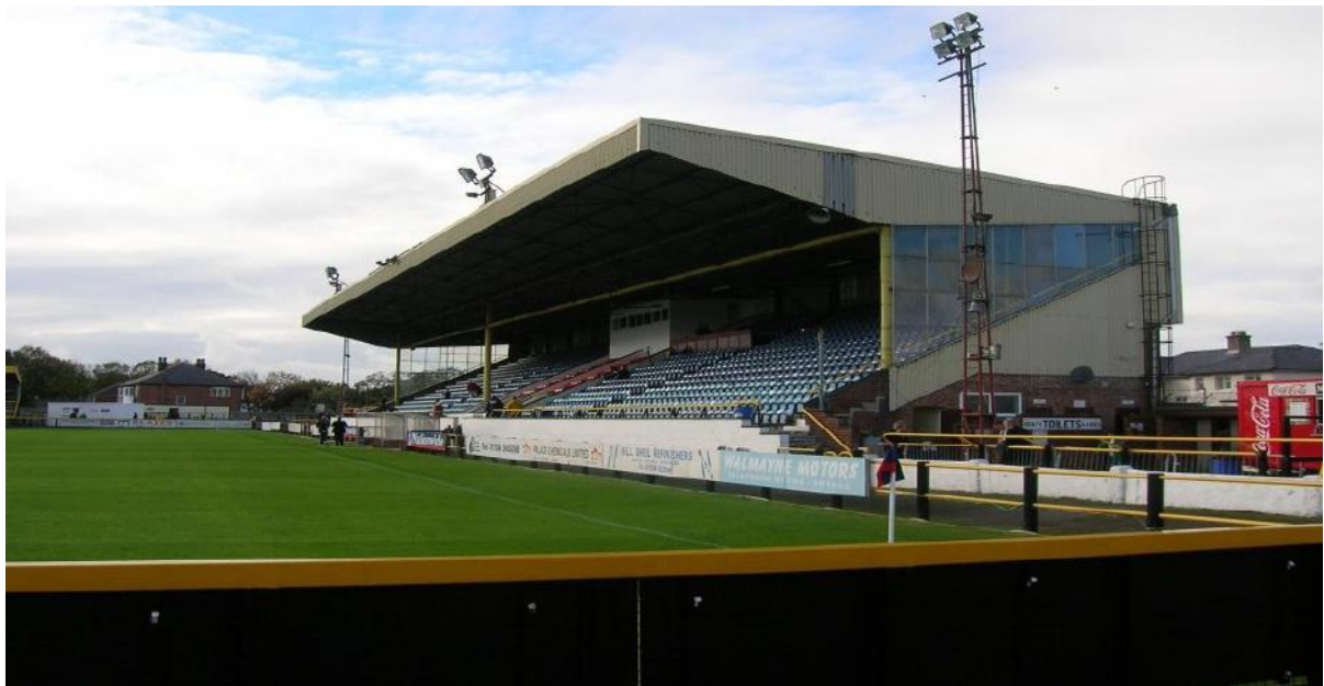
The Main Stand

Train to Southport Railway Station walk out onto Chapel Street turn right and walk up to Station Stop HD and take the Arriva in Merseyside 64 bus to Curzon Road/Forest Road walk to the bottom of forest Road turn left into Haig Avenue and the ground is on the left.