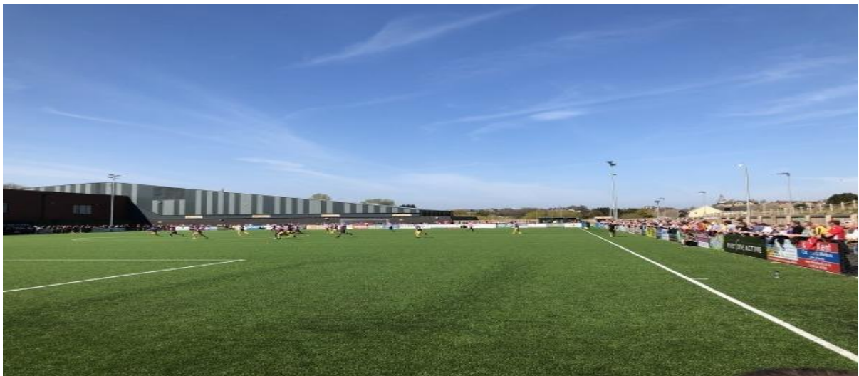
St Margaret's End and Car park Ends