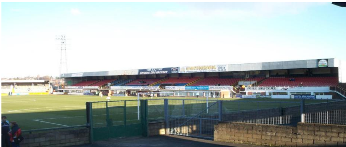
Merton Meadow Family Stand

The view from the terracing on the lower tier can be obscured by a number of supporting pillars, but also has the benefit of being very close to the touchline. The proximity of the A49 road immediately behind the stand limited the amount of room to build, hence the relatively small number of rows of seating. Ticket allocation is split between home and away supporters with the Meadow End side allocated to home supporters.