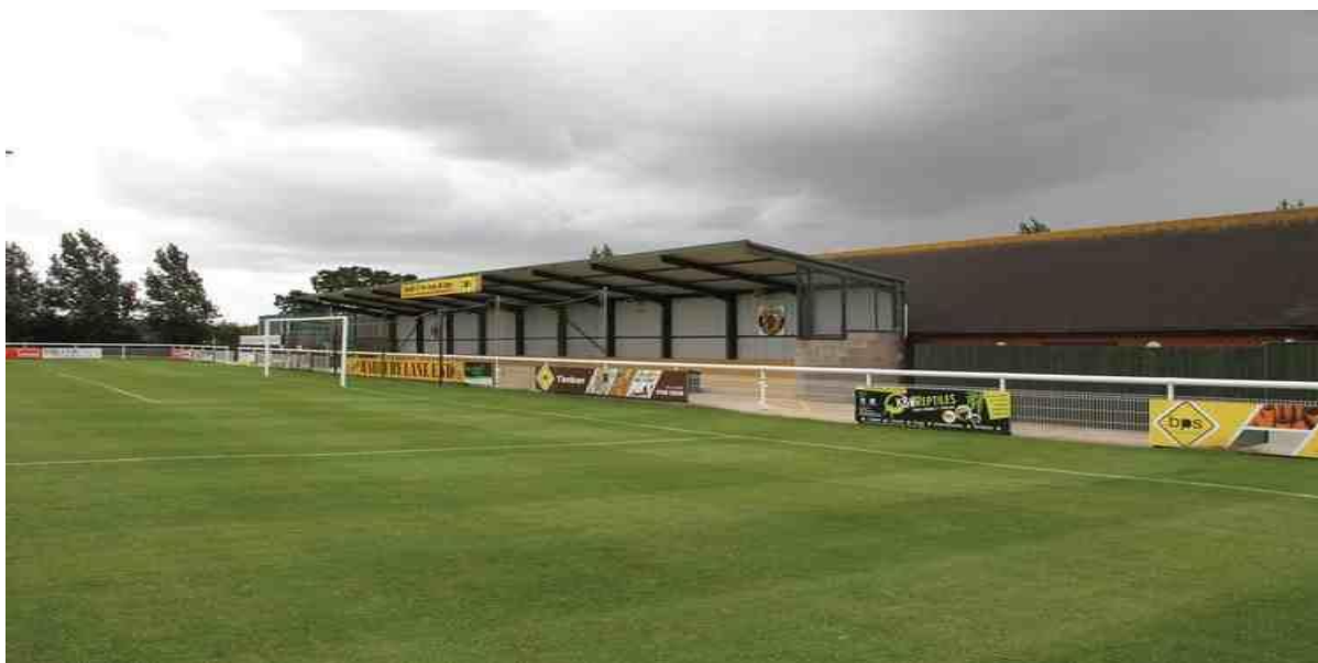
Harbury Road End

The club moved from the Old windmill Ground to the New Ground in 2000 the New Windmill is just over a Mile from the old ground in Tachbrook Rd, Leamington Spa. At the Harbury Lane End of the ground is where the Club house and main entrance are situated it is a small covered terrace. It runs for around half the width of the pitch and sits directly behind the goal. On one side is a flat standing area; whilst on the other side is a portakabin type structure that serves as a corporate facility. Opposite is the North Bank, a large open terrace.