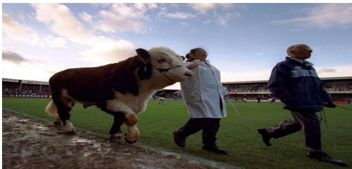
The live Herford Mascot

Exit the M4 at junction 21 onto the M48 and over the New Severn Bridge and At junction 2, take the A466 exit to A48/ Chepstow/ Cas-Gwent At the roundabout, take the 3rd exit onto Wye Valley Link Rd/A466 Continue to follow A466 Go through 3 roundabouts after crossing the Wye Bridge in Monmouth take a right onto the A40 continue on till you pass the Cafe Diner and take the next exit for Hereford and at the end of the road turn left onto the A49 go through two roundabouts on the A49 till you reach Hereford. At the roundabout, take the Greyfriars Bridge/ Victoria Street Road (A49) then at Steels Garage, keep left into Edgar Street. Take Blackfriars Street (right) immediately before the football stadium. Turn left for parking.